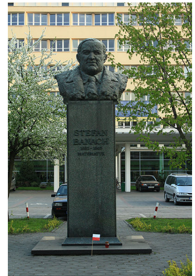
Banach monument Krakow